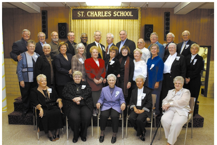
Saint Charles School Class of 1952 Reunion