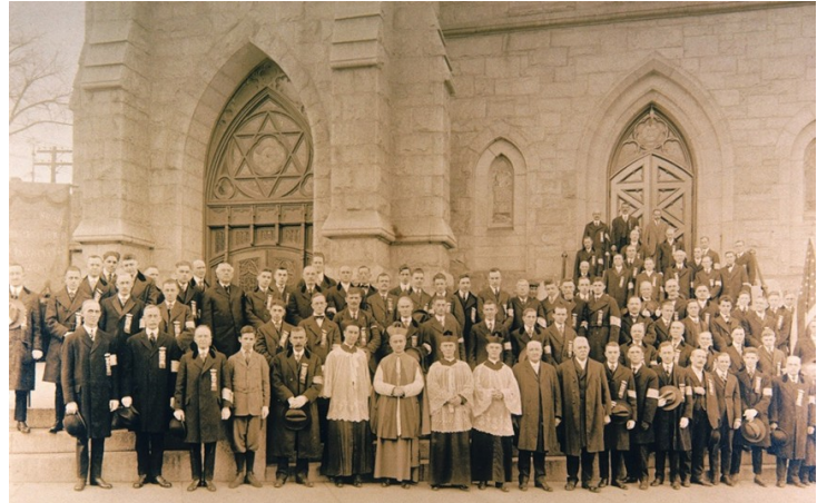
A parish group gathering in 1917