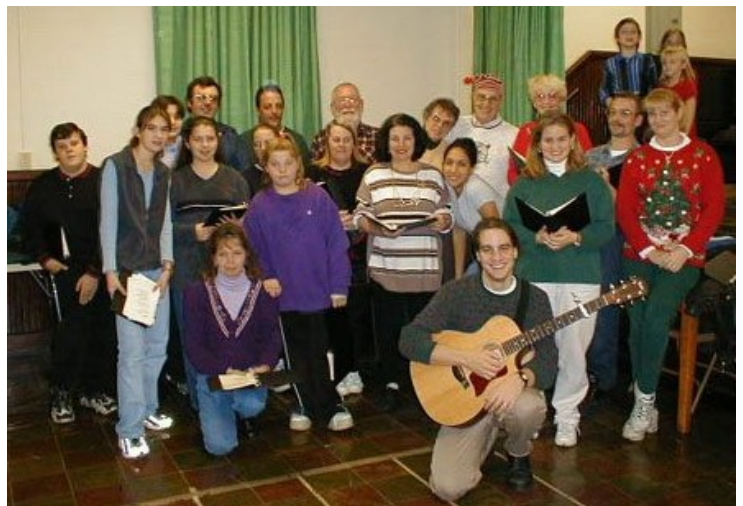
1999 Christmas Caroling at Saint Francis House