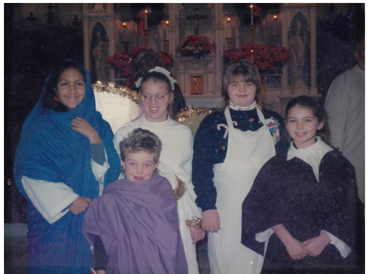
1996 Christmas Pageant