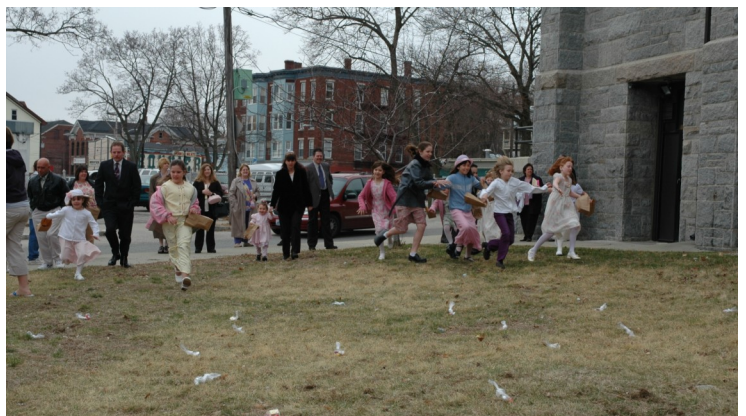
Easter Egg Hunt, April 11, 2004