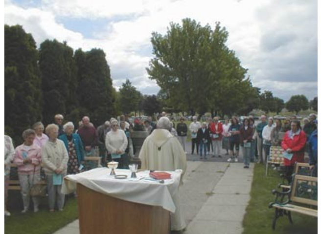
Memorial Day Mass at the Cemetery 2002