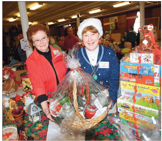
Christmas Bazaar 2011