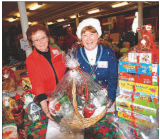
Christmas Bazaar 2011