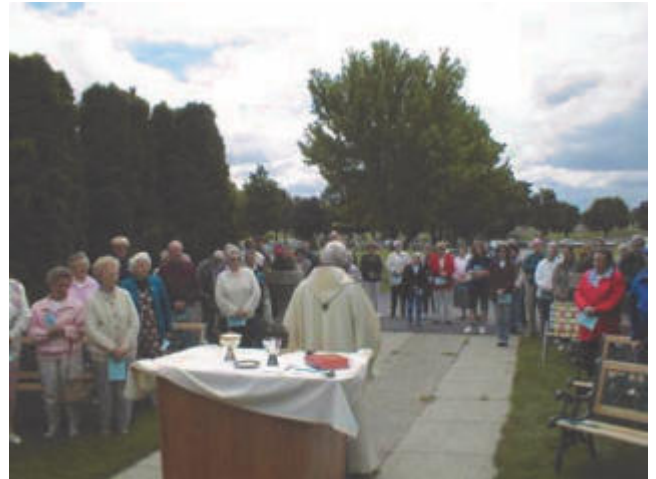
Memorial Day Mass at the Cemetery 2002